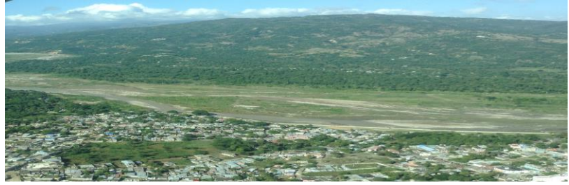
Vue Aérienne de La Vallée de Jacmel

1847 rue des Vents, Sainte-Julie, QC, J3E 1L6 NEQ: 1167346129 – NE: 84383 6289 R001